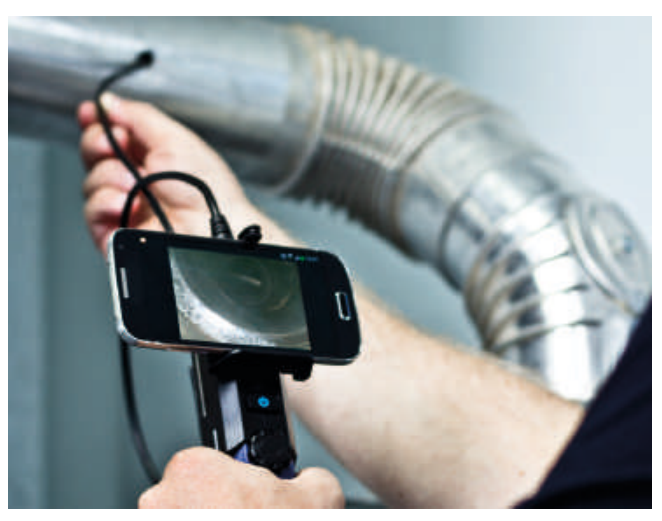
Manage pictures on your smartphone

The small Wöhler VE 200 fits in every pocket. It transmits the image and video files via WLAN to your mobile device, if desired also simultaneously to the tablet and the smartphone.