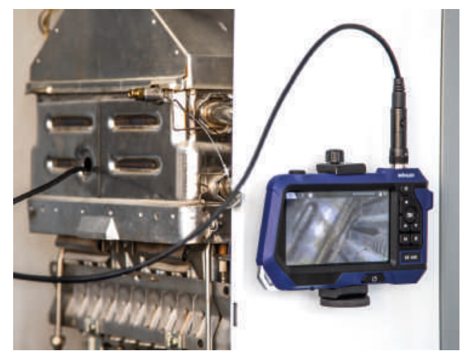
Hands free for working With the magnetic holder you can securely attach the Wöhler VE 400 to any magnetic surface. This leaves your hands free for working.