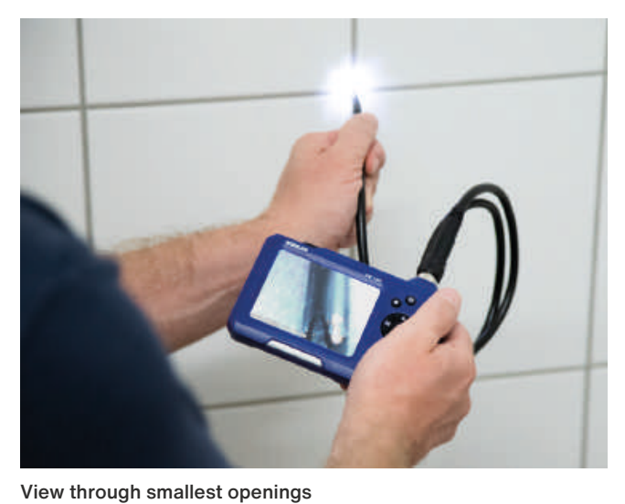
Just a Ø 6 mm opening in a tile cross is sufficient to view the installation behind the wall (in the picture Wöhler VE 320).