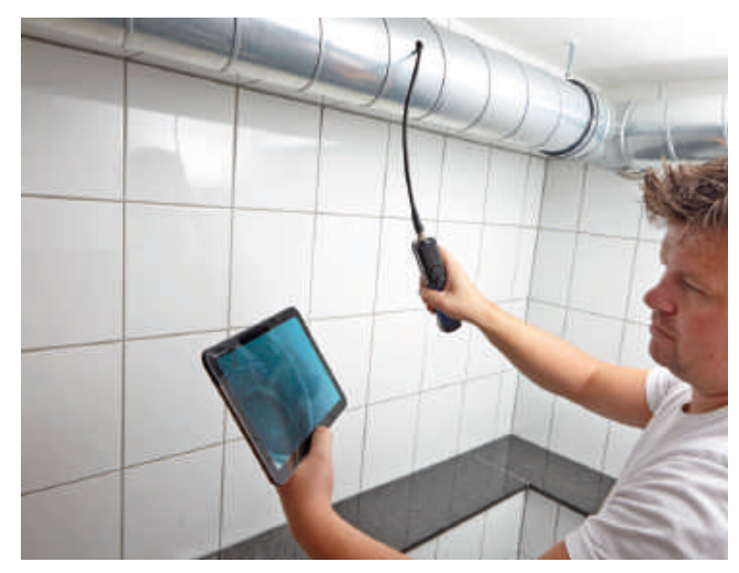
Choose your own display

The small Wöhler VE 200 fits in every pocket. It transmits the image and video files via WLAN to your mobile device, if desired also simultaneously to the tablet and the smartphone.