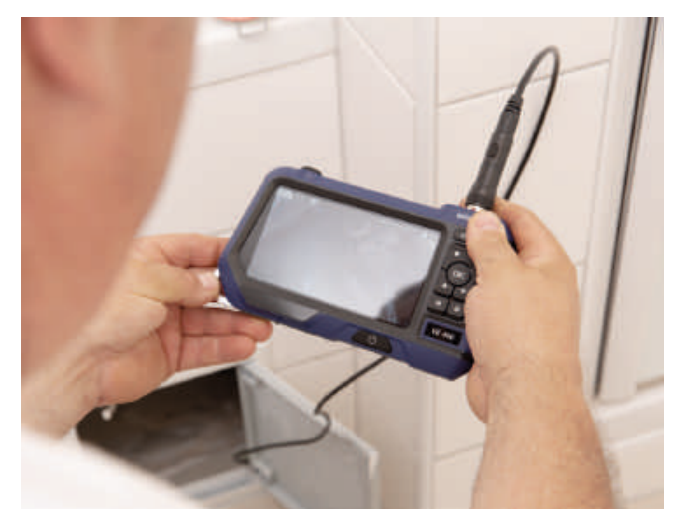
Large 5" screen Moisture under the bathtub? With the Wöhler VE 400 the cause is quickly found.