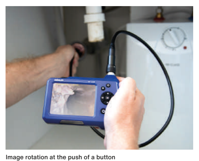
The display can be quickly rotated by 180° for easier navigation. The flexible probe easily passes bends.