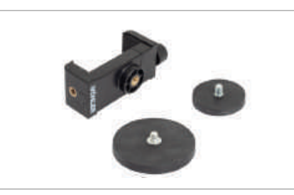
Article no. 6986

for Wöhler VE 200 / 320 / 400 and probes