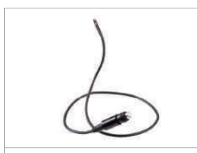
Article no. 6928

for Wöhler VE 320 / 400 for sewage/exhaust gas pipes from Ø 40