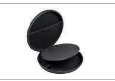
Article no. 6914

for Wöhler VE 320 / 400 flexible extension cable between Wöhler VE 400/ VE 320 and Video-Endoscope-probes